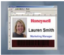
Photo-ID Badge Production

WIN-PAK PRO Central Station offers integration for monitoring a customer's digital video system. Operators can monitor live video from up to 16 different accounts at a time. Operators can pan, tilt and zoom cameras from any account. Remote monitoring also includes Visual Video Verification, which allows a live image to be compared to a stored database image of an individual before access is granted.